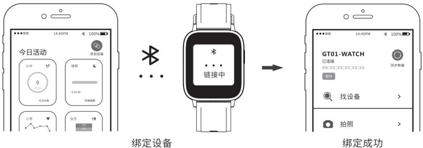
图 4-3 VDB1616 绑定设备指导图/Binding device guide

Open the app related permissions according to the prompts in the pop-up box. Click More>+ Add device> Add device, available select and click GT01.WATCH in the device list, and then the watch and mobile phone will automatically start binding and pairing and synchronize data.