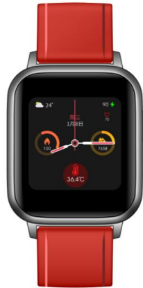
图 1-1 VDB1616 正视图/Top view

The watch uses a contact charging interface, and can be charged normally by connecting it to a USB 5V power supply with a USB adapter. The watch has a built-in 200mAh rechargeable lithium battery, which enables 24-hour continuous temperature monitoring.